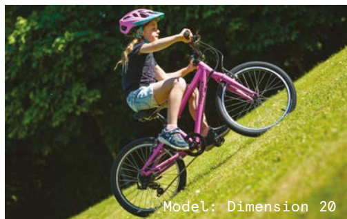
Model: Dimension 20

Our long-running MX series has updated colours and graphics and are now paired with an A-head stem on all sizes for 20in upwards. This helps save weight, improves looks but also offers the same range of adjustment as the previous design. We have even added two new models in the Serenity and MX26. Based around a 26in wheel and a robust specification, it's the ideal bike for those fast-growing kids.