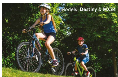
Models: Destiny & MX24

Our lightest and best ever kids range – Page 10