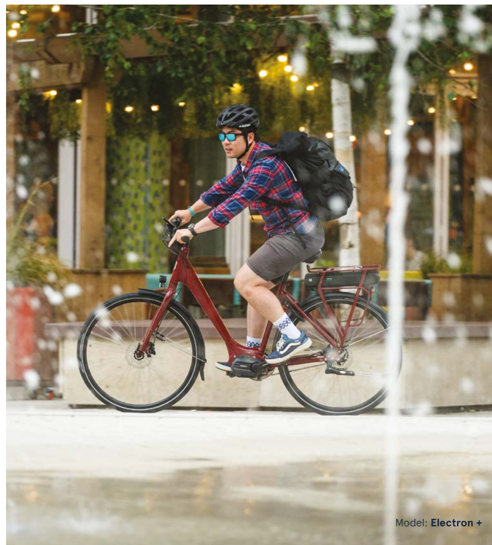
Model: Electron +

New to our range for 2020 is Sport Drive. Designed by our assembly partner in Europe, Sport Drive is the perfect system to compliment Shimano STEPS. Working on a similar mid-drive system, Sport Drive uses a Dapu drive unit paired with a Panasonic battery. Household names in the electronic industry, providing an exciting electric bike experience at a fantastic price point. For 2020 we are offering Sport Drive in two configurations, our E-SUV Arcus model is ready to tackle rough tarmac, gravel and trails whilst our familiar Electron model is perfect for everything from commuting to the weekend spin to the shops.